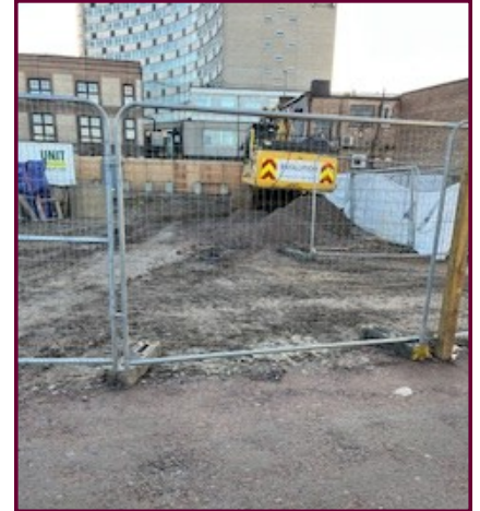
Preparing the site for the new hotel in Crown Lane, Morden as seen from Windermere Avenue.

I shall be focusing on all of these and shall give you updates on any developments. As usual, if you have any local issues that you think Ed or I can help with, please tell us. At the same time, we should acknowledge and be grateful that our current local challenges are not as grave as many of the national and international ones.