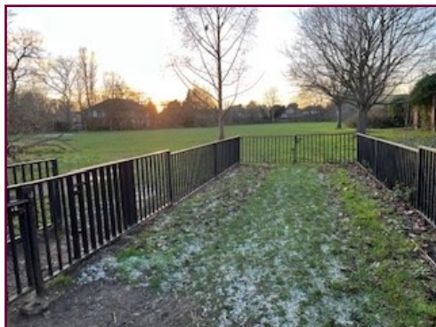
A frosty New Year afternoon in Church Lane Playing Fields.