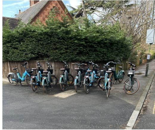
Abandoned e-bikes outside John Innes Park, Mostyn Road

Heart shaped Covid memorial flower bed in John Innes Park