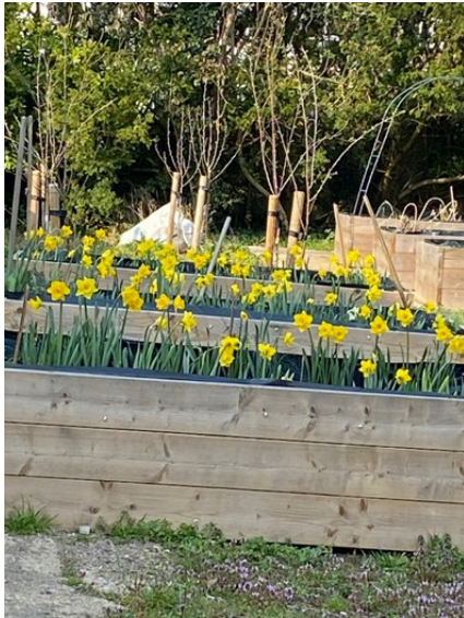
Daffodils planted by volunteers in the Tranquil Corner of Mostyn Gardens