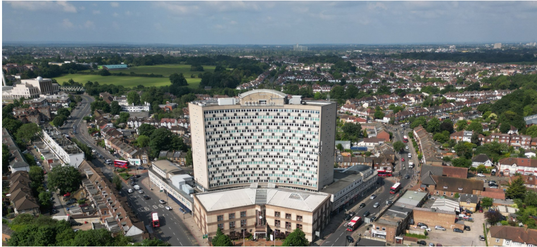
Merton Council celebrates its 60th Anniversary this year

nostalgic fun as we commemorate six decades of Merton working with the community. It promises to be a fantastic opportunity to connect with neighbours, enjoy themed activities, and reflect on some of the council's achievements over the years. Stay tuned for more details and make sure to mark this important date in your calendar.