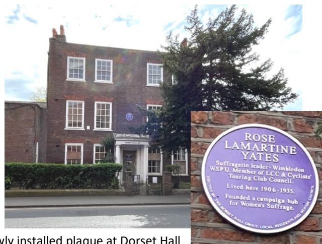
Newly installed plaque at Dorset Hall