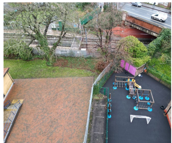
View from Dorset Road showing existing access to tram stop via Morden Road

At our MPWRA meetings, I will continue to report on progress.