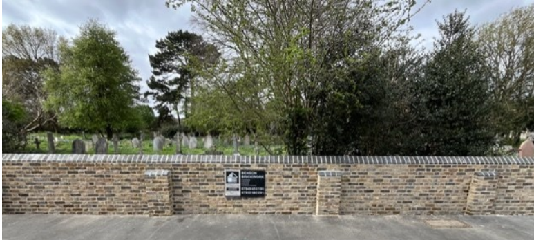
Excellent restoration work on St. Mary's Churchyard wall -well worth the wait!