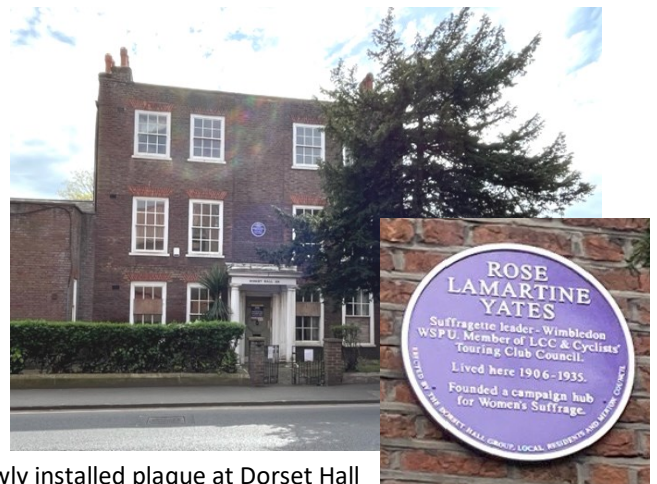
Newly installed plaque at Dorset Hall