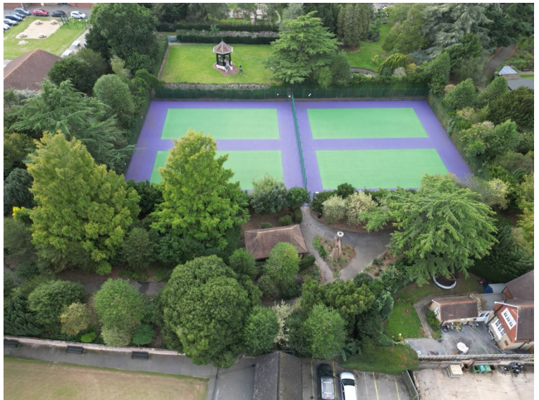
Aerial view of the re-surfaced tennis courts in John Innes Park looking at their best.

The refurbishment of the tennis courts in John Innes Park took place over September. The spring edition of FORUM reported that the courts had been cleaned to remove moss and other detritus. One of the courts had surface damage from tree roots which prevented it being of any real use to serious tennis players. The nets were removed from the courts in the summer to enable re-surfacing which is now complete. Four courts will be available shortly.