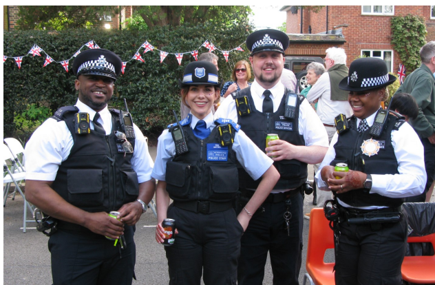
Two of our Safer Neighbourhood Team and some colleagues enjoying a coronation street party.