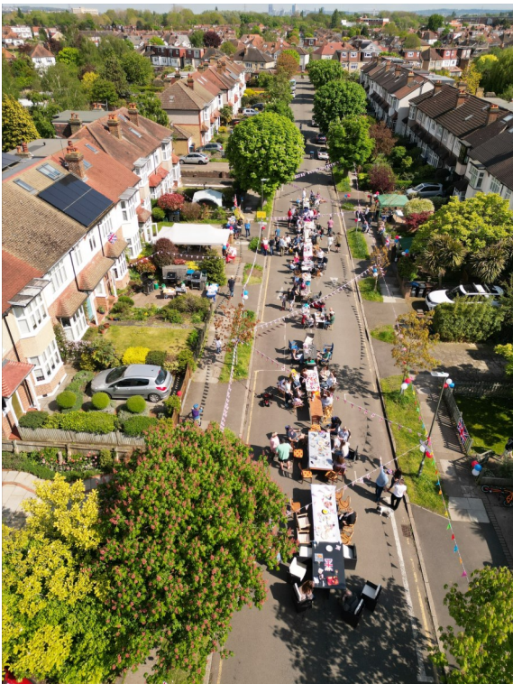
Aerial view of a coronation street party in full swing.

The project includes improvements to gate access and a new booking system to ensure users will have access to tennis courts at the time of their choosing. The new booking system and gate access technology make it easier to get on court by booking in advance to guarantee availability. To make sure that the future costs of court maintenance are covered Merton Council is now tendering for a court coaching operator to work with them to bring tennis coaching to all areas of the borough. This partnership between the council and the LTA is an exciting initiative that will help Merton take another important step forward in its ambition to become London's leading borough of sport.