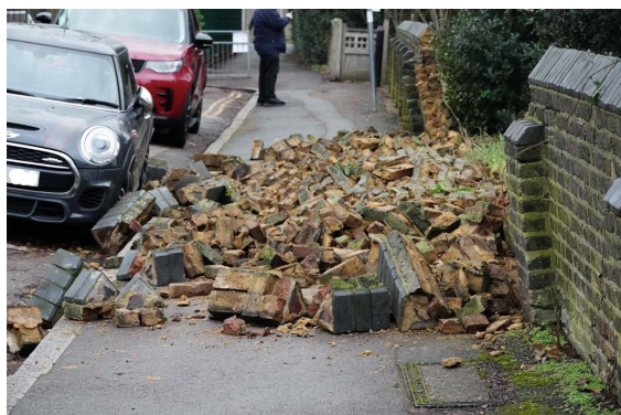
St Mary's Church wall before bricks moved from pavement

As many residents will probably know, the wall has been leaning in places for many years and unfortunately at the end of January a large section of it collapsed onto the footpath of Church Lane. I was notified and attended and the bricks were cleared from the path. The wall is the responsibility of Merton Council and both Merton Park Councillors had previously supported a bid for some money to repair it. The wall is due to be repaired in the coming months after the rest of the wall has been surveyed and we have asked to be kept informed. Repairs could take some time because the specialist stonemasons capable of such repairs are in high demand.