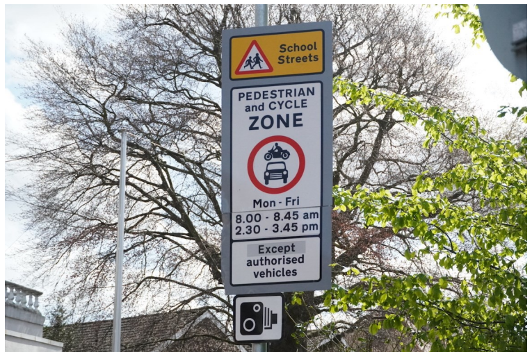
Make sure you have a current permit to drive on these streets

DHG have decided that they have taken it as far as they can and asked that MPWRA now take this on and work with Clarion and any prospective buyer. However, MPWRA are currently too stretched to take on further commitments but if anyone works in architecture, building or law and is willing to get involved please get in touch.