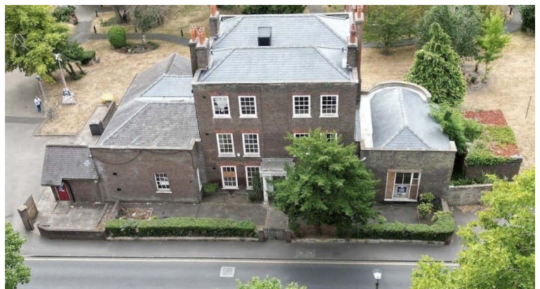
Aerial view of Dorset Hall